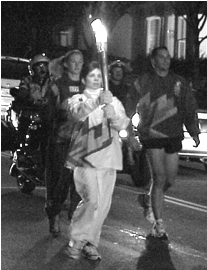
The Olympic Torch lighted Eureka Valley as it made its way to Salt Lake City for the XIX Winter Olympic Games. The closing ceremonies are on Sunday, February 24 th on NBC, now on cable 3 ( but that's another story ).