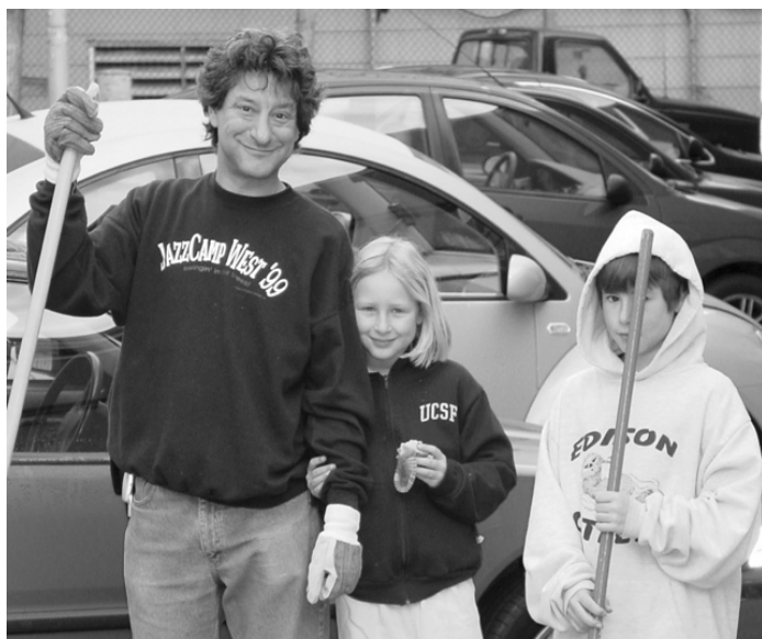
One of the hard-working teams at the Castro Bubble Bath.

San Francisco, CA 94114-0137 Address Service Requested