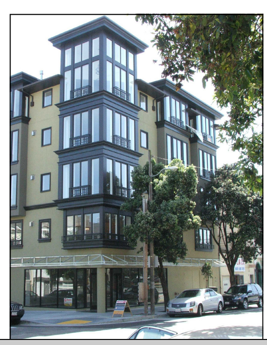
Upscale new condominiums at 2 Landers St. at 14th St. add 14 housing units and off-street parking.

<u>53-55 Henry Street</u>: An application to add a horizontal addition to the rear of the property, creating a third dwelling unit and increasing the footprint of the building. The changes do not appear to require a variance, and the front of the building would not be altered. It would increase the height of the building from 2 stories over garage to 3 stories over garage.