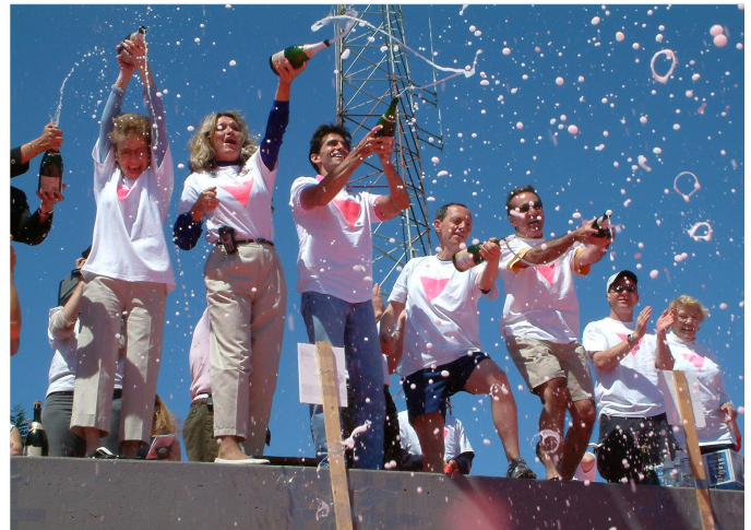
Friends of the Pink Triangle