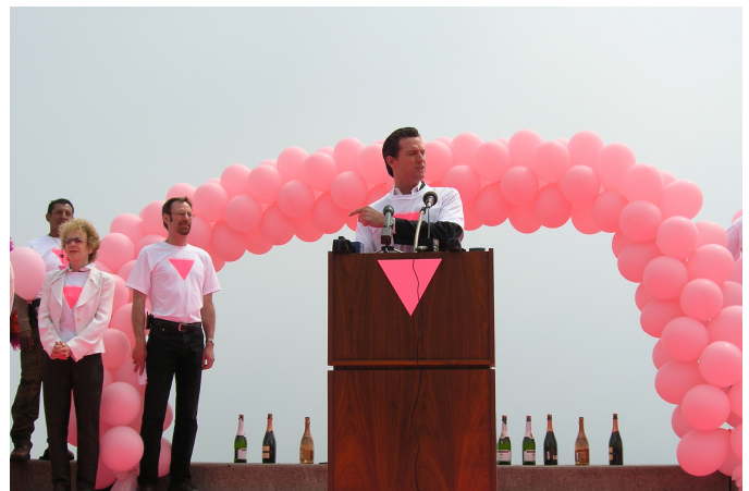
Mayor Gavin Newsom